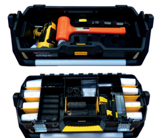
Hardware Tool Box