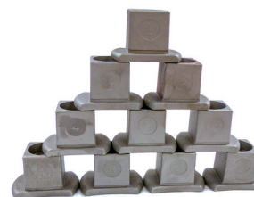
Emergency Nuts (#1-10)