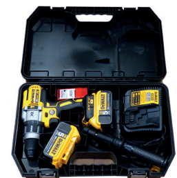
Drill Kit for Stem Tapping